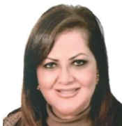
H.E. Hala Helmy El-Said

Since he left the Tunisian Ministry of Finance in December 2011, Mr Ayed has been an active public speaker promoting his vision for a prosperous Tunisia. He is a regular guest speaker of prestigious academic organizations and civil society forums. He continues to serve as director in the board of the Tunisian Caisse de Dépôt et de Consignation (CDC) that he founded in 2011; and as an independent member of the national joint committee in charge of supervising the reform of the financial system, and the restructuring of public banks. Mr. Ayed set-up a technology group in 2012 (the Vega-Group of Companies) to empower about 70 young Tunisian graduates and young professionals, many of them unemployed at the time, engaging them in IT career opportunities.